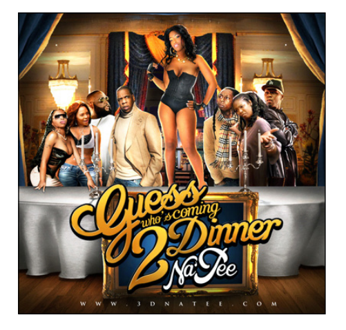
GUESS WHO'S COMING 2 DINNER 2010