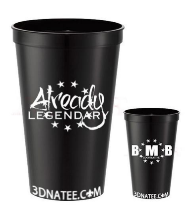
THE STADIUM CUP $5.00