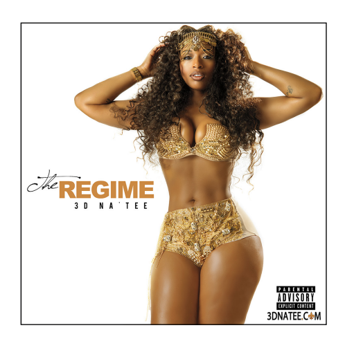
THE REGIME 2016