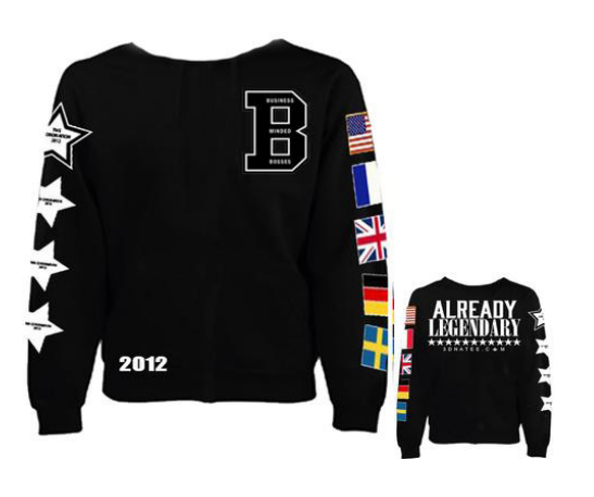
THE ALREADY LEGENDARY SWEATSHIRT $45.00